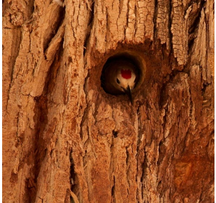
Figure 12. Gila Woodpecker (Melanerpes uropygialis), a species covered under the LCR MSCP.

Many of the LCR MSCP target species are now using newly restored and created riparian habitat, as found in recent surveys of conservation areas (Table 1). Habitat creation sites have provided several species, including the Sonoran Yellow Warbler, Summer Tanager, Arizona Bell's Vireo, and Vermilion Flycatcher, with new habitat hectares that would otherwise have been unsuitable. Many species, however, still occur in lower numbers in habitat creation than in habitat preservation sites, while other species are still absent. Long-term monitoring is needed to determine what can be done to further improve habitat suitability, whether conservation actions simply need more time to become effective, or whether other factors not related to habitat needs may