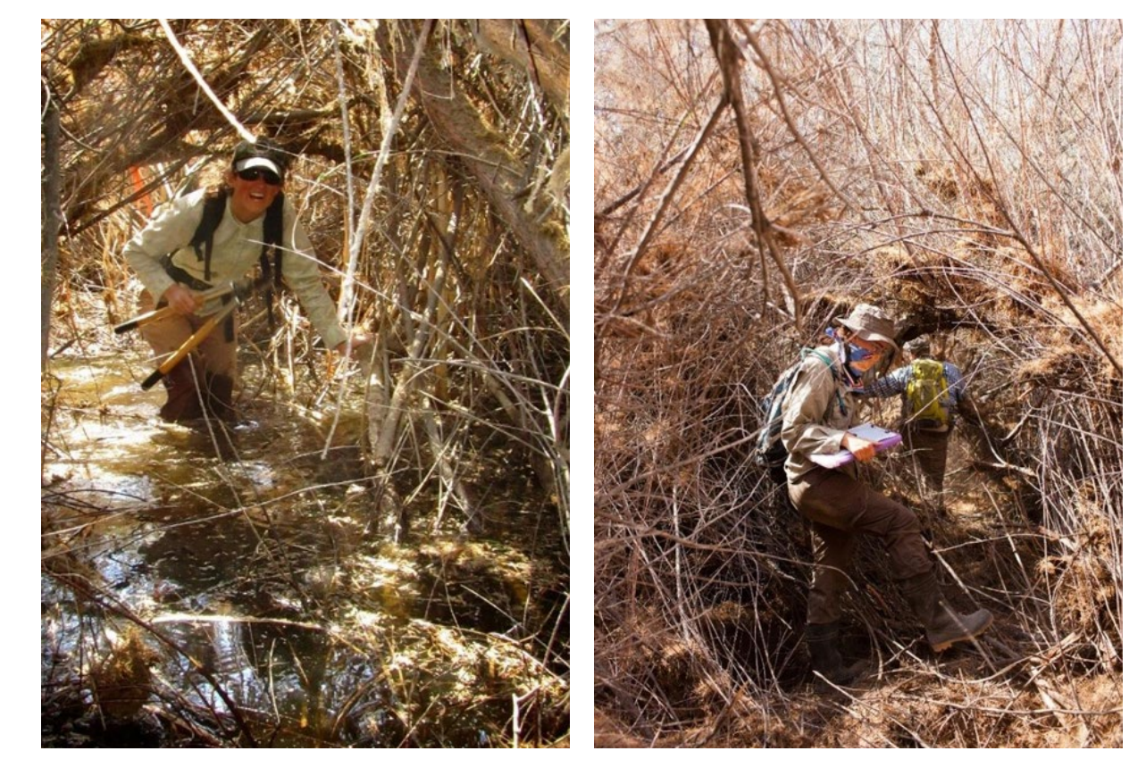
Figure 10. Trail clearing and data collection by GBBO staff.

The data collected since 2007 show dramatic increases in several bird species along the lower Colorado River since the 1970s, even when taking into account that different monitoring methods were used in different decades (Table 1). For example, the Yellow Warbler and Bell's Vireo, which were almost absent during the 1970s, had already begun to return to many places along the river prior to conservation action from the LCR MSCP. These rebounds can be attributed to many factors, as illustrated in Box 1. Other species appear to have