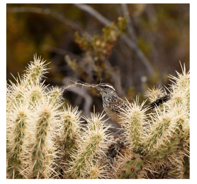
Figure 11. Cactus Wren (Campylorhynchus brunneicapillus) with nesting material.

approximately the same population levels today as in the 1970s—for example the Gila Woodpecker, which relies on trees big enough for excavating nesting cavities. Still other species that were present in the 1970s have now dropped to near zero. These include the Gilded Flicker, which was historically common in parts of the study area and is now nearly extirpated<sup>12</sup> in riparian habitats in the region. It is unclear why some species are resilient to major environmental change, while others are not, and only continued conservation research can illuminate possible underlying causes.