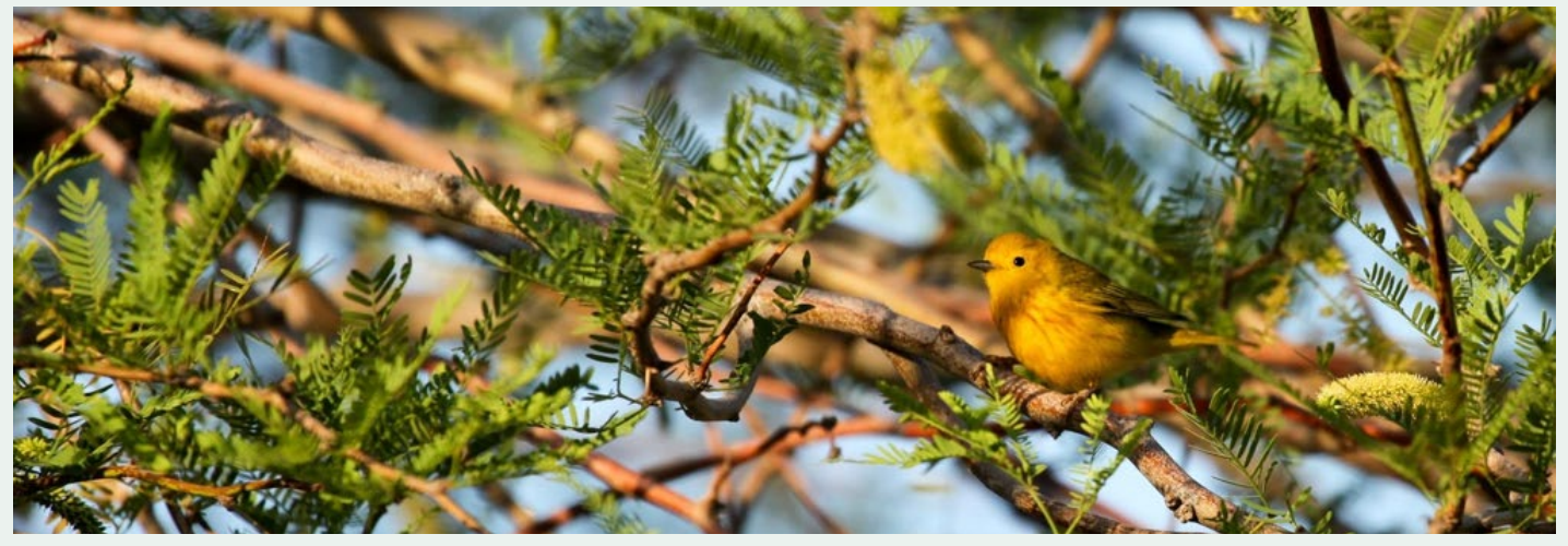
Figure 9. Yellow warbler (Setophaga petechia), a species that has recovered on the lower Colorado River in recent years.

Of all the songbirds nesting in riparian areas along the lower Colorado River, Yellow Warblers experienced the most dramatic changes in population densities. In the early 1900s, Grinnell found Yellow Warblers to be abundant and estimated that approximately four males occupied every 0.4 ha of cottonwood-willow habitat in some areas (Grinnell 1914). By the late 1970s, however, only one single successful breeding attempt was documented, and only a handful of singing male Yellow Warblers were found throughout the study area from Davis Dam in southern Nevada to the Mexican border (Rosenberg et al. 1991).