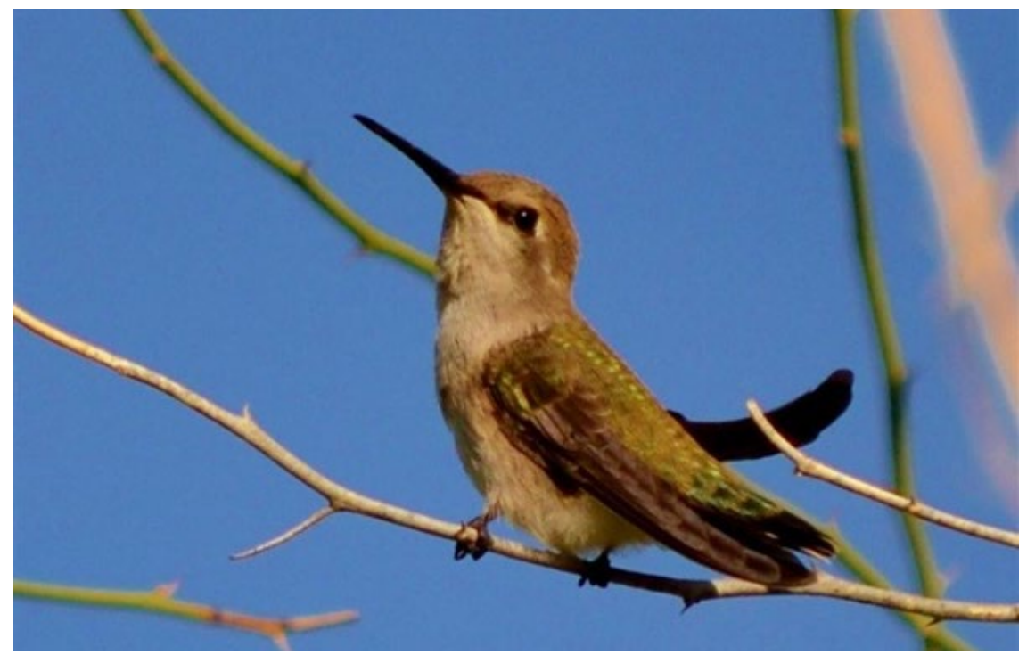
Figure 8. Costa's Hummingbird (Calypte costae) recorded during surveys.

Today, birds are often used as a tool for measuring ecosystem response to conservation action because: 1) they are comparatively easy to monitor and bird monitoring techniques are already well-studied (e.g., Sutherland et al. 2004); 2) they are considered excellent indicators of overall environmental health because, as a community, they rely on a large variety of ecosystem features and services (e.g., Wiens 1989); and 3) they are often conservation targets themselves due to population declines (Rosenberg et al. 2016). Because birding is among the most popular outdoor activities in the United States (USDA 2002), bird monitoring also provides an excellent opportunity for the public to participate as citizen scientists in collecting bird population data (Dickinson et al. 2012, Tulloch et al. 2013).